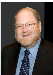
James E. Rothman