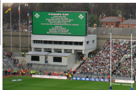
Outdoor Screen (with the words of Ireland's Call)