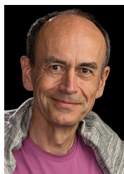
Thomas C. Südhof

The awards confirm the grip the US has on the Nobels. Remarkably, they have won at least one of the 6 categories every year since 1936. They won their first award for physiology or medicine in 1933 and, according to the Nobel Prize web page, have gone on to win it 69 times. The nearest rival in the winning stakes for this category is the UK with 23 successes. The gender balance is decidedly skewed towards males with no female winners of the medicine prize coming from the UK and just 5 from the US. In fact, out of all Nobel Prizes awarded since their inception just 5% are female laureates.