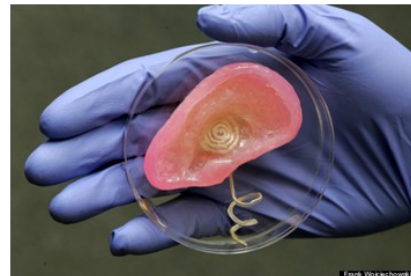
A Bioprinted Ear

Another new technology which has come to the fore recently is the 3D printer. It is a primitive ancestor of Star Trek’s replicator which Captain Jean Luc Picard of the Starship Enterprise used to order “tea, earl grey, hot”. While we are not at the stage of voice-operated replicators 3D printers can do some amazing things.